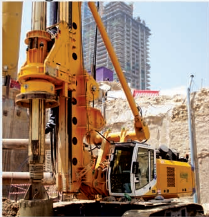
Piling & Foundations